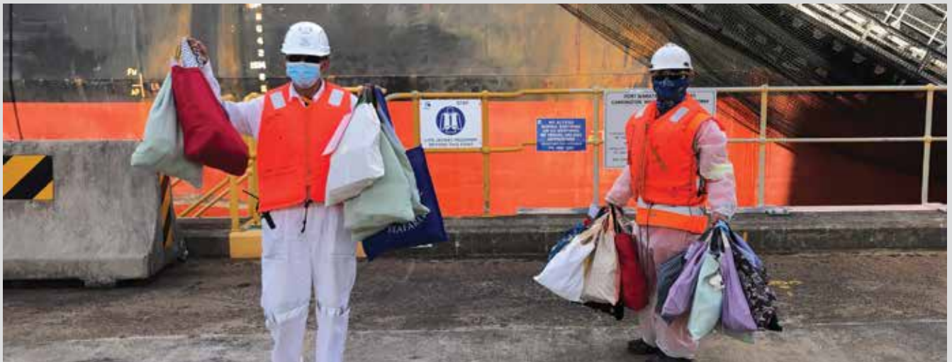
Seafarers receiving gift bags in time for Christmas.