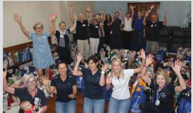
Port Waratah employees with volunteers to pack the gift bags.