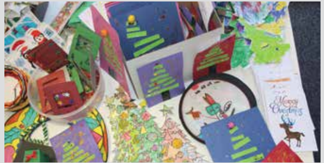
Cards and decorations created by students to share the joy of Christmas with seafarers.

Students from 20 schools, preschools and OOSH centres were involved in the initiative creating more than 900 colourful pieces of Christmas cheer for the seafarers. Many seafarers have been away from their families for a long time and this thoughtful addition from local children helped them feel appreciated and a little closer to home.